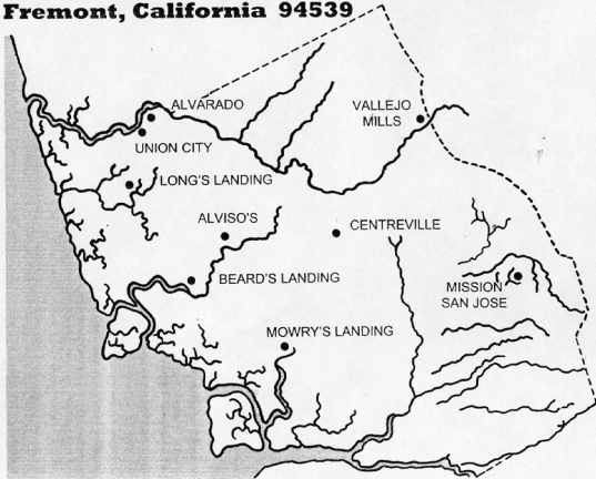
WASHINGTON TOWNSHIP 1853 - 2003

Washington Township Historical Society P.O. Box 3045 Fremont, California 94539