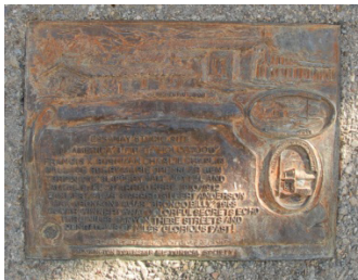
Plaque in present condition