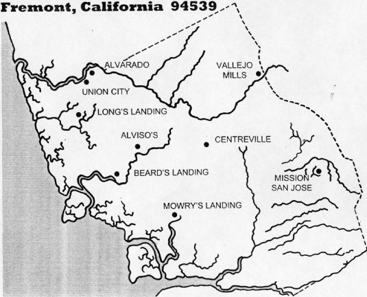
WASHINGTON TOWNSHIP 1853 - 2003

Washington Township Historical Society P.O. Box 3045 Fremont, California 94539