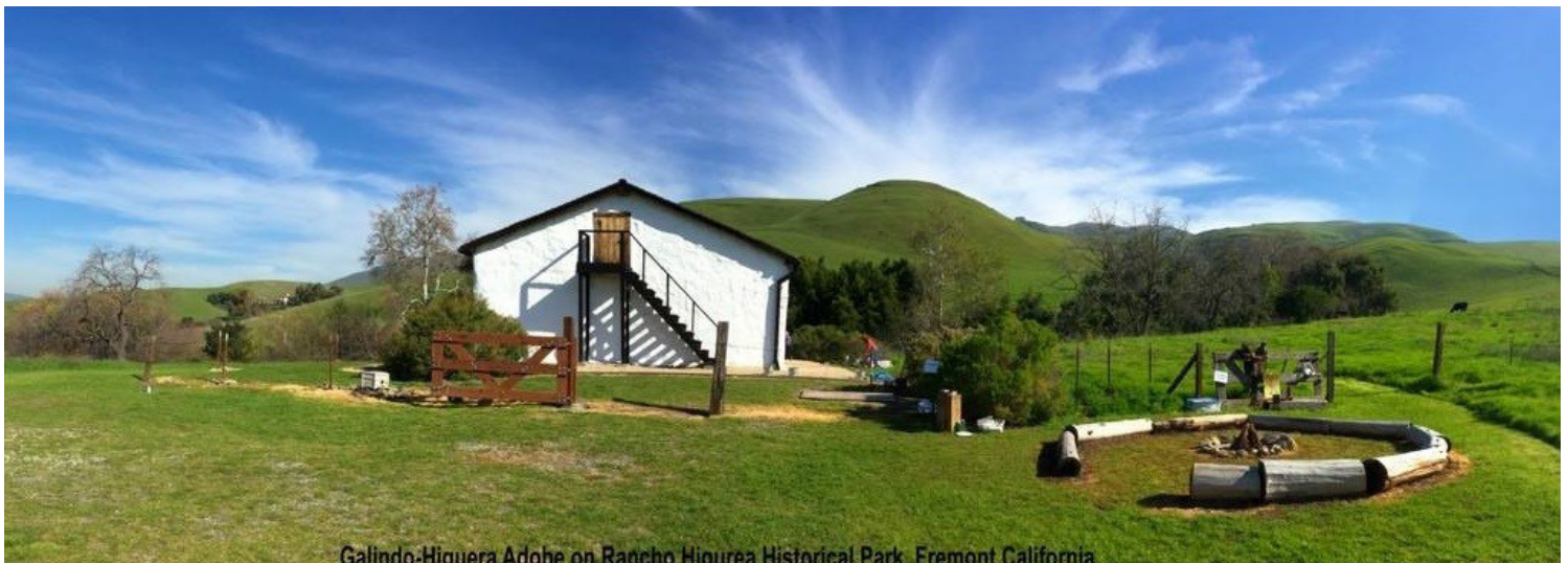
Galindo-Higuera Adobe on Rancho Higuera Historical Park, Fremont California