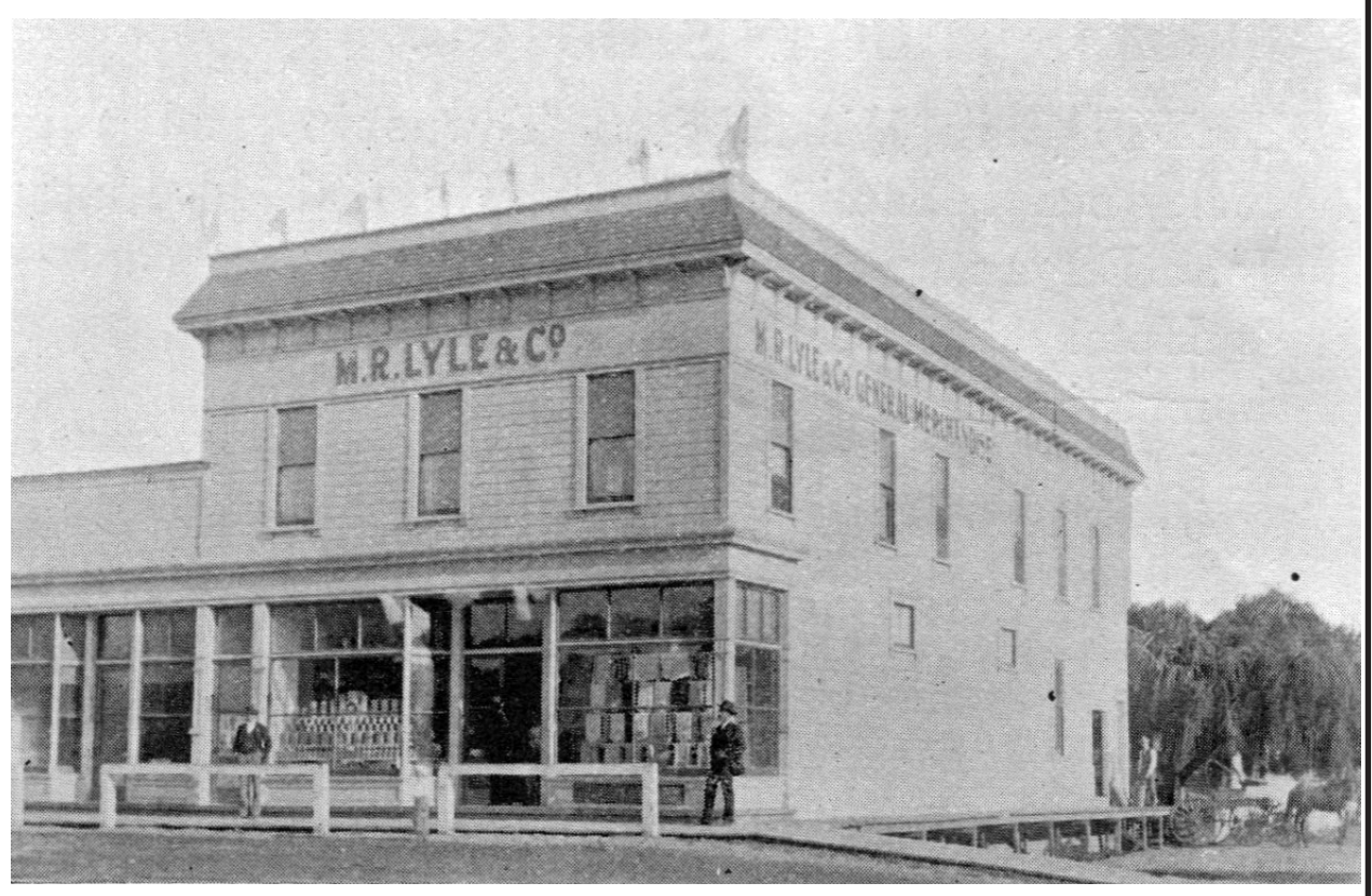
A picture of the Lyle building from about 1896

In 1976, Uncle Joe's Pizza opened in the lower part of the building and continued until 1996, when the business changed to Bronco Billy's Pizza.