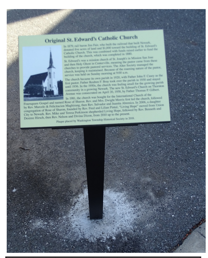
The Old St. Edward's Catholic Church Plaque as it looks installed in front of what is now the "The Living Hope Foursquare Church" on the corner of Sycamore and Graham in Newark.