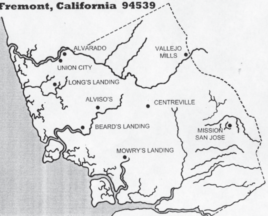
WASHINGTON TOWNSHIP 1853 - 2003

Washington Township Historical Society P.O. Box 3045 Fremont, California 94539