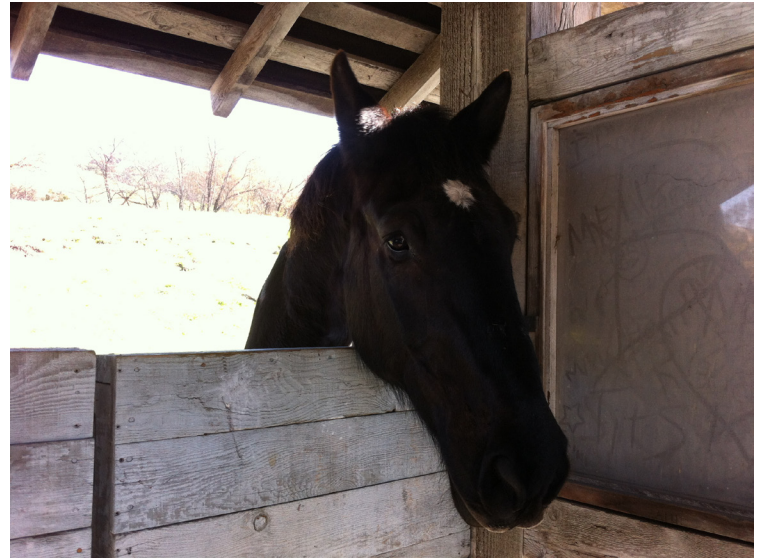
This is our sidewalk (corral) superintendent.