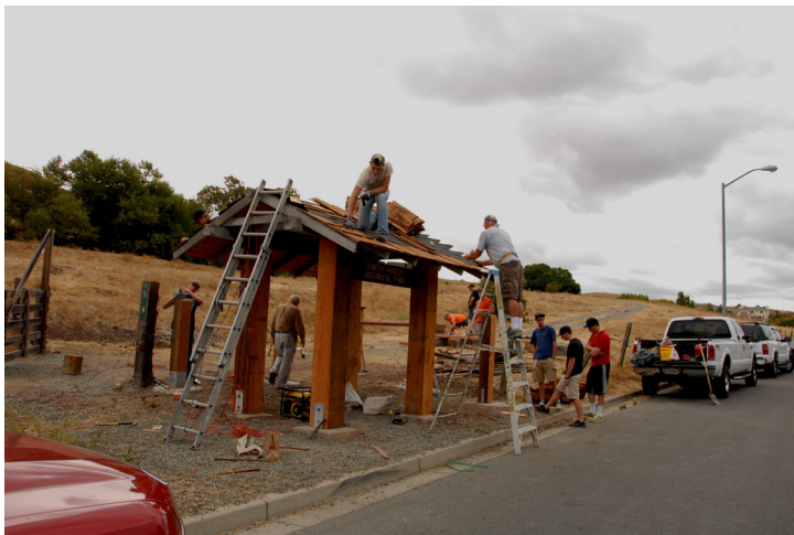
During the process, replacing old wood with new wood.