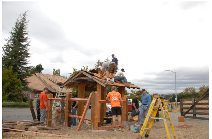
The work continues.