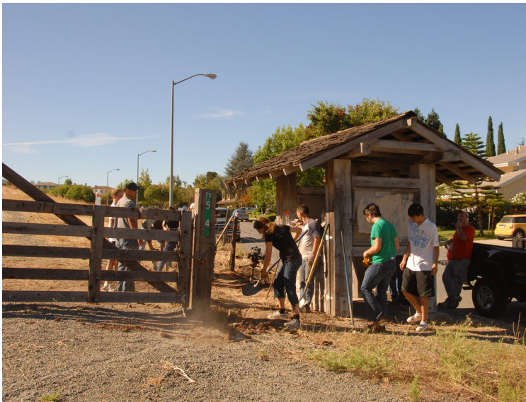
This is what it looked like when we started.