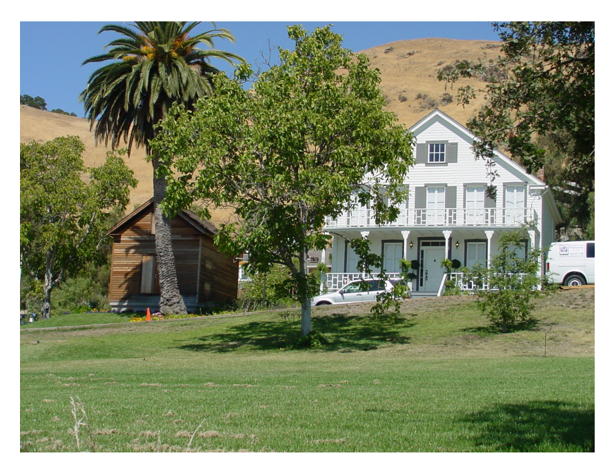
Blasdell/MacIntosh House from Canyon Heights Road

had learned from the High Street project so the City insisted that the historic mansion be fully restored before they could sell the last home in the new development.