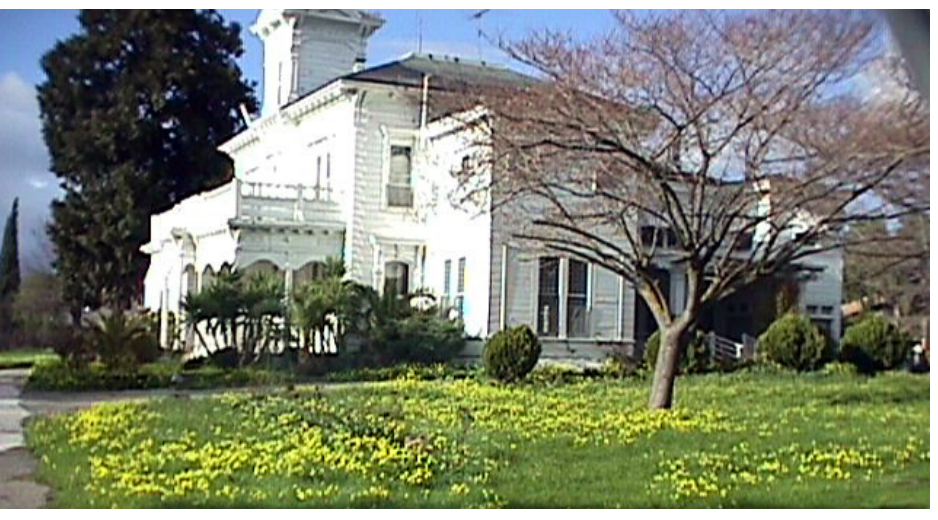
Curtner Mansion on Wabana Common

on several acres of land with a barn, tank house, and wash house. A developer was allowed to develop the land behind the historic house with a large view corridor to the historic house. They were also supposed to move the tank house, which they did not do, but built a new one that was a copy of one in wine country. They were also supposed to restore the historic house which was not done very well but the historic house was sold to a young couple who enjoyed the historic element and they did a marvelous job of restoring the historic house.