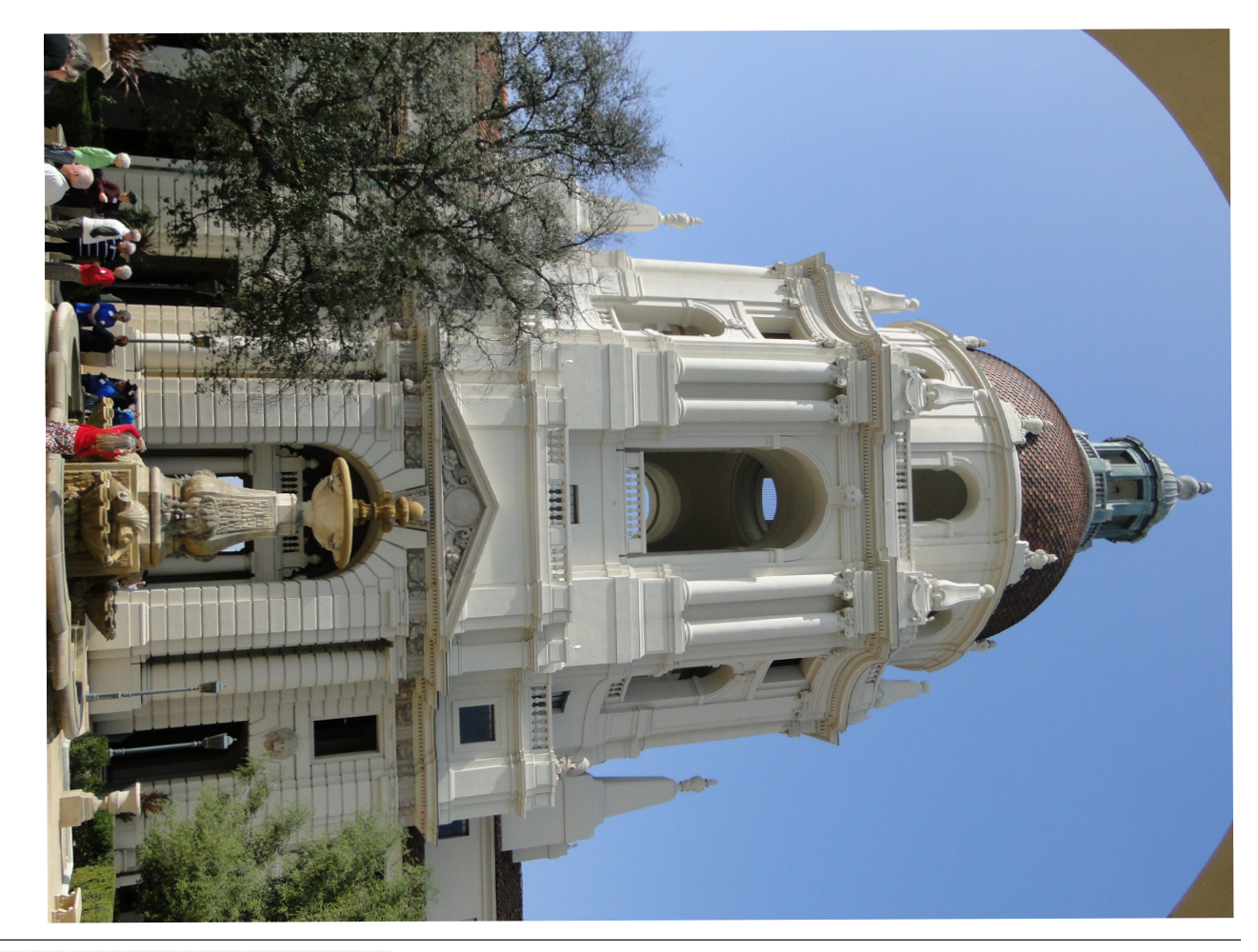
Washington Township Historical Society P.O. Box 3045 Fremont, California 94539

Pasadena City Hall, photo by Al Minard on a bus tour of Pasadena during the Conference of California Historical Societies Symposium on February 25, 2012