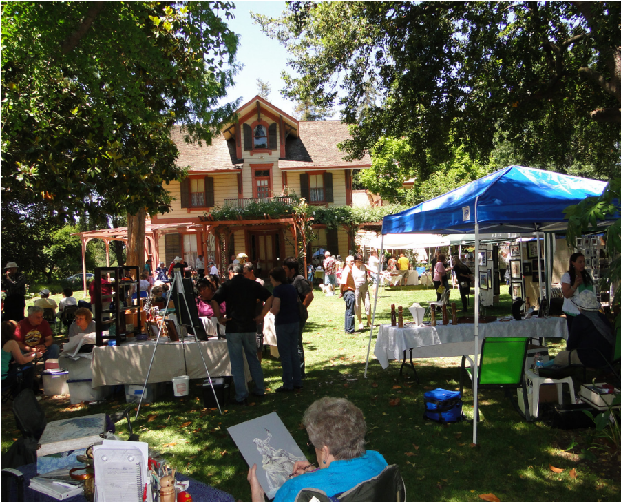
Arts & Crafts at Shinn Park, 2013