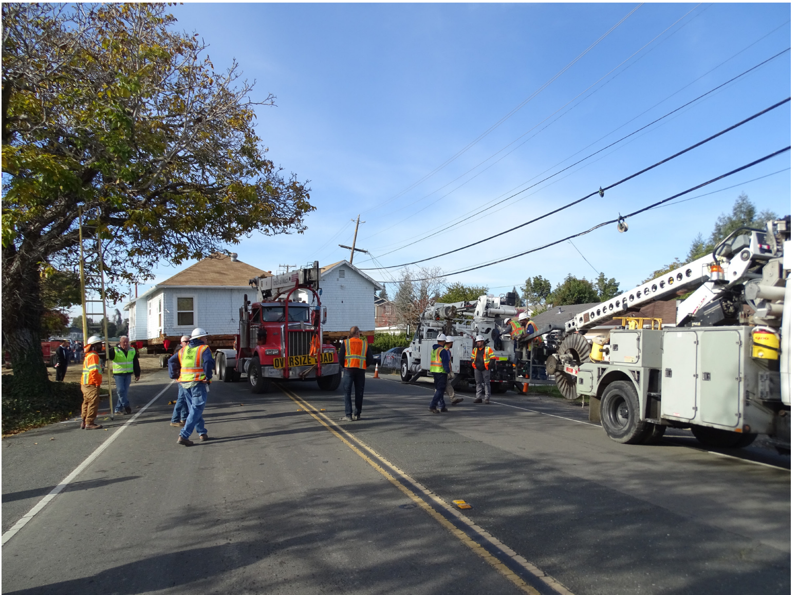
Moving the “Pop” Goold house on December 10, 2017

Members who have paid their dues since our last meeting