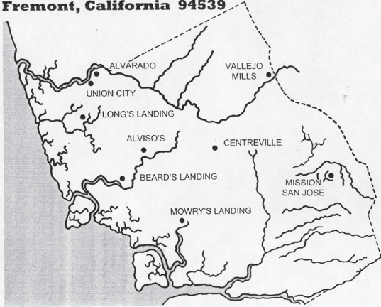
WASHINGTON TOWNSHIP 1853 - 2003

Washington Township Historical Society P.O. Box 3045 Fremont, California 94539